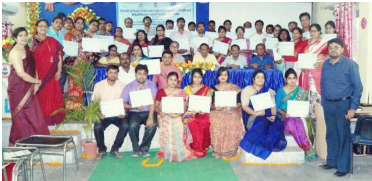
Group Photograph of participants after completion of the thirteenth sensitization programme on 15 th June 2018.