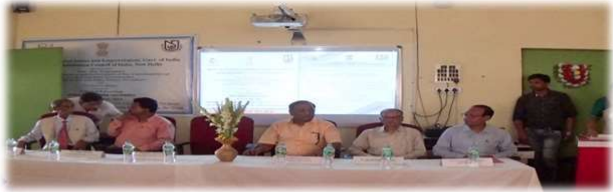
Inaugural session of 18 th Sensitization Program on 30 th to 31 th May, 2019 at BKM College of Education, Ramkanali, Dist-Purulia, West Bengal.