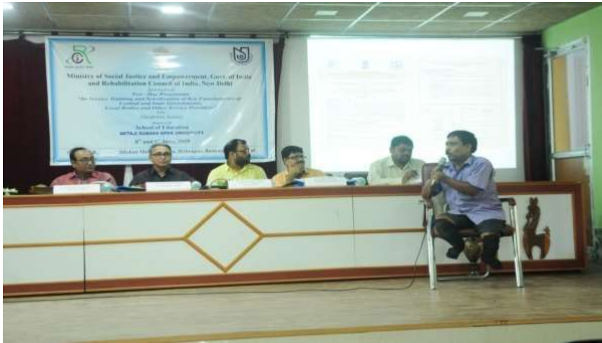
Role Model delivered his life history for the second sensitization program on 8 th June, 2019 which was held at N. B. Sikshan Mahavidyalaya, Bishnupur, Bankura, West Bengal.