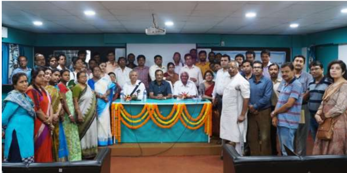
Group Photograph of the participants at the 3-Day Sensitization Workshop related to In-service Training and Sensitization of Key Functionaries of Central and State Governments, Local Bodies and Other Service Providers under the aegis of Rehabilitation Council of India, Govt. of India and organized by NSOU as Nodal Agency in West Bengal was held during KadambiniGanguly Memorial Hall, 3rd Floor, Composite Arts Building, Golapbag, BurdwanUniversit