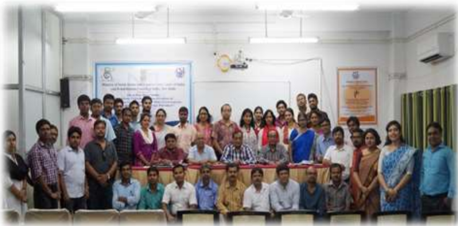
Group Photograph of the participant at the 14 th Sensitization Program at Netaji Subhas Open University, Kalyani Campus Ghosh Para Station Road, Kalyani Nadia-741235, West Bengal on 21 st June, 2018