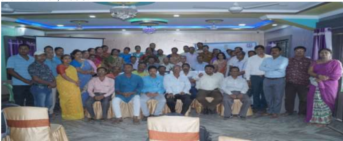
Group photograph of the 22 nd Sensitization Program on 5 th -6 st July, 2019 at Diamond Harbour.