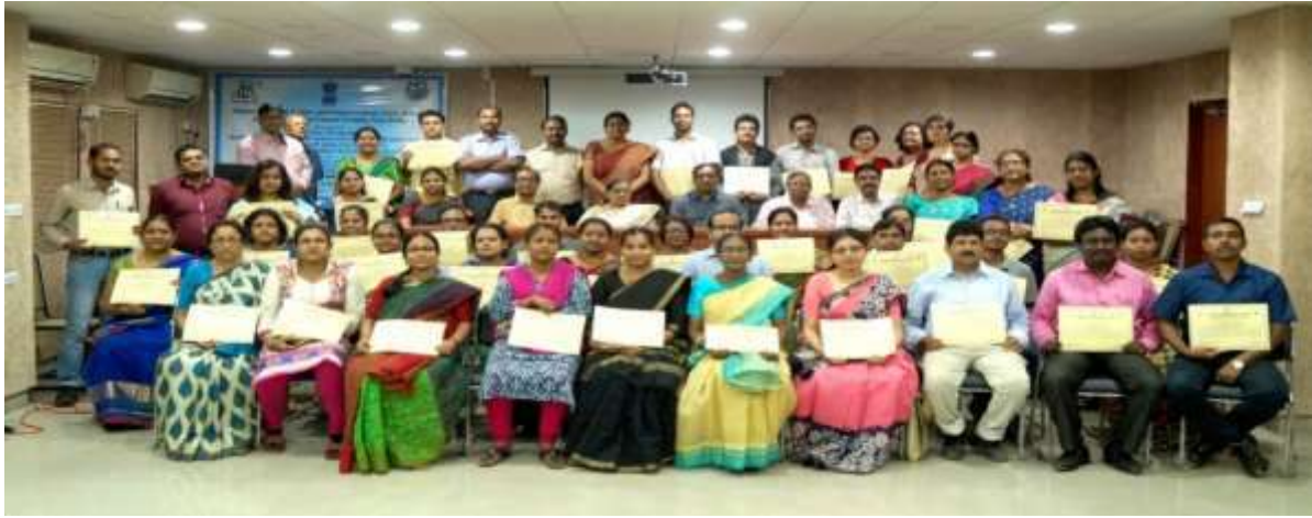
Group Photograph of the participants at the 3-Day Sensitization programme related to In-service Training and Sensitization of Key Functionaries of Central and State Governments, Local Bodies and Other Service Providers under the aegis of Rehabilitation Council of India, Govt. of India and organized by NSOU as Nodal Agency in West Bengal was held during 11- 13 November, 2016 at the Seminar Room, NetajiSubhas Open University HQs, DD-26, Salt Lake, Kolkata- 700064.