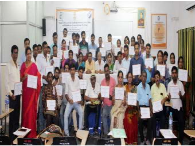
Group photograph of participants, after completion of the 23 rd Sensitization Program on 25 th -26 th June, 2019, at Netaji Subhas Open University,