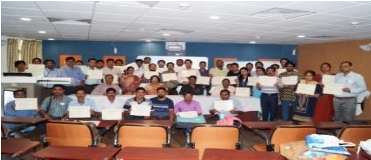
Group Photograph of participants after completion of the ninth sensitization programme.

Participants of 10 th sensitization programme on 18 th to 20 th May, 2018 at Vivekananda hall, Vidyasagar University, Paschim Midnapur, West Bengal.