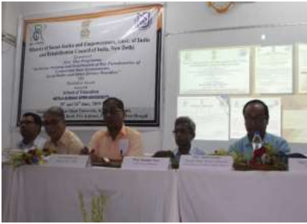
Inaugural session of the 23 rd Sensitization Program at Netaji Subhas Open University, Kalyani Campus, Kalyani Ghosh Para Station