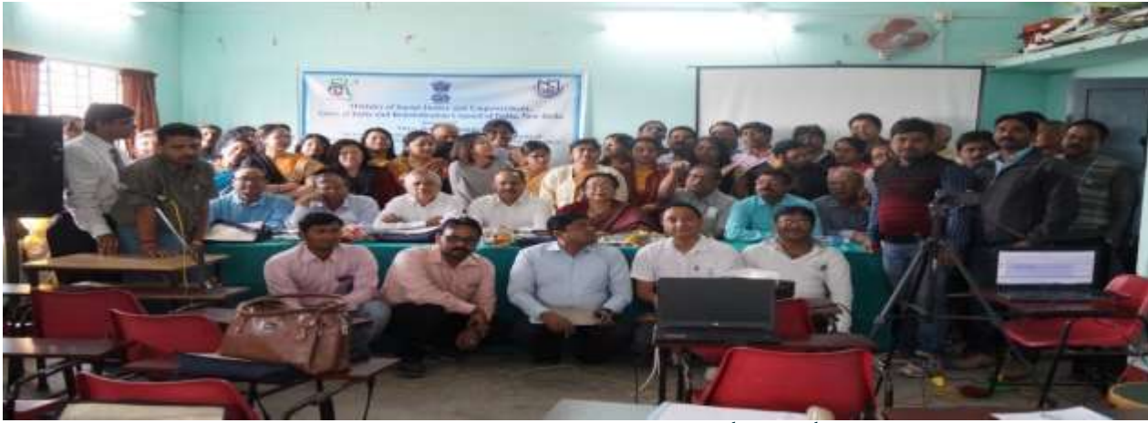
Group photograph of the participants which was held during 16 th to 18 th February 2017 at the North Bengal Handicapped Rehabilitation Society, New Town, Shushrut Nagar, Siliguri, Darjeeling, West Bengal.