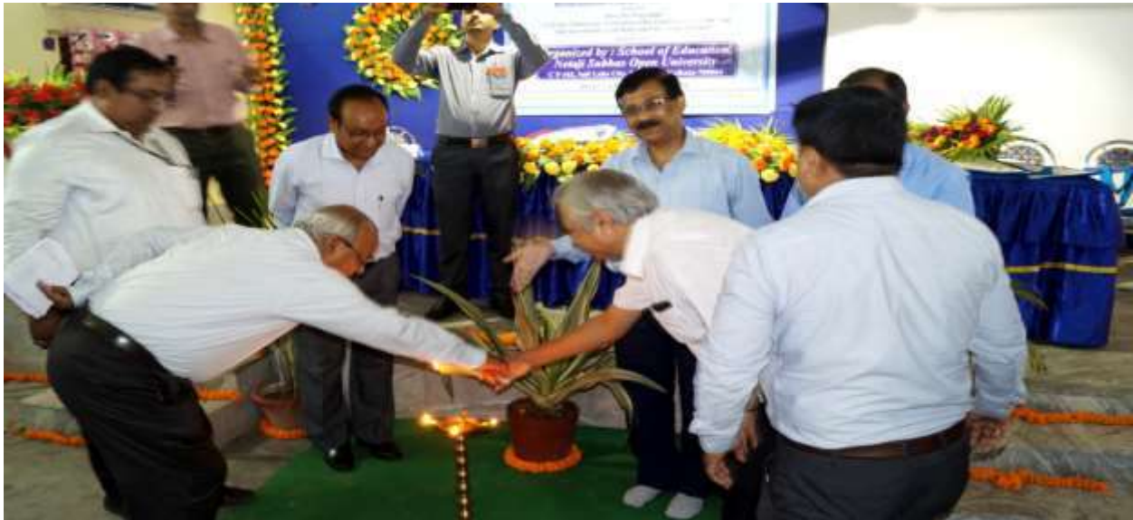
Lighting the lamp for inauguration of the thirteenth sensitization programme on 13 th June, 2018 at SurendralalDas Teachers' Training College, Anandanagar, Nischinda (Bally), Howrah-711227, West Bengal.