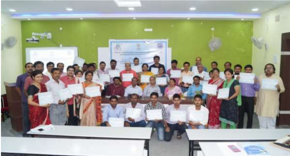
Group Photograph of the participant at the 3-Day Sensitization Program related to In-Service Training and Sensitization of Key Functionaries of Central and State Governments, Local Body and Other Service Provider under the aegis of Rehabilitation Council of India, Govt. of India at organized by NetajiSubhas Open University as Nodal Agency in West Bengal was held during 25 th to 27 th May, 2018 Bankura Christian College P.O. – Bankura, Pin-722101, West Bengal.